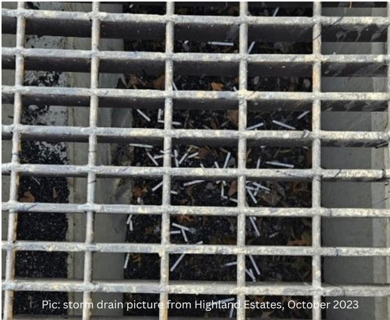
Pic: storm drain picture from Highland Estates, October 2023

When out in your neighborhood what litter do you see? Is it cigarette butts in the street, candy wrappers near a garbage can in the park, or glass near your curbside collection location? Wherever you see the litter, what is your response? Do you pick it up or let it for someone else? If you let it for someone else, do you think the next person is actually picking up the litter? Any trash in a place that it should not be is considered litter. Where does the litter come from? According to studies, 53% of litter along roadways comes from motorists while 23% of the litter is from pedestrians.