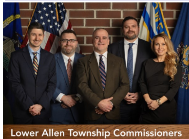
Lower Allen Township Commissioners

Lower Allen Township • 2233 Gettysburg Road • Camp Hill, PA 17011